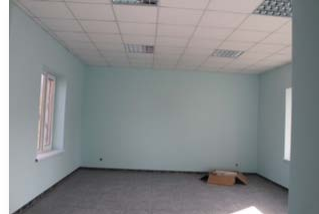
Interior all but done