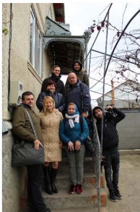
Camera crew at the MWCF sponsored Fortuna Home for Orphans in Drochia