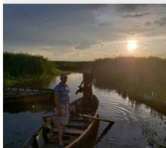
Making the rounds in Manta...filming at a home constructed by MWCF for deaf mute mom and her two sons