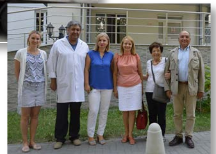
The Moldova-Italy Connection