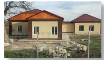
Landscaping, furnishing, and staffing up next