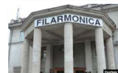
National Philharmonic Hall...built in the early 1900s

September 2020 brought disaster to Moldova’s historic National Philharmonic Hall...a huge blaze consuming the building, reducing everything to ashes, including all of the Symphony Orchestra’s instruments. Constructed in 1912, the cultural center served over the years as a revered platform for several MWCF sponsored youth given the opportunity to demonstrate their developing natural talent. Now it is gone, efforts to rebuild the structure are well beyond MWCF means alone. Where we can help is with a modest expansion of one of our previous initiatives...providing musical instruments. High quality instruments in excellent condition can be donated to MWCF, and overseas transport will be arranged. Contributed items not selected for orchestra use can either be audited for sorely needed cash or awarded as competition prizes for deserving grade school students aspiring to become musicians.