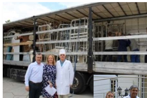
One of the trucks from Verona, Italy