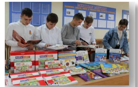
Students exploring their school's new English books

Over the years, MWCF has teamed up with others in trucking donated aid from Western Europe... principally originating in Italy, Switzerland, Belgium, Germany, and the Netherlands. Again spearheading these shipments has been MWCF's collaboration with the charity A.O. CICD PHOENIX.