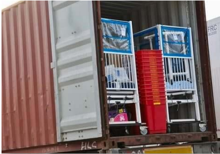
Sea-land container ready to be unloaded in Chisinau, Moldova

Shipping delays led to the aid arriving in early March 2020. Fortuitously, the shipment included many items ideally suited for helping establish Moldova's first two coronavirus hospital response units.