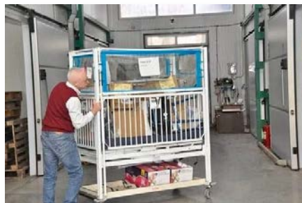
Pushing to get maternity ward cribs moved timely into place