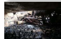
Photo from audience area now