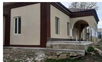
Exterior close to its finish

Obvious necessity for major guttering repair of the long-ago abandoned Ruseni community center revealed the need to replace the entire roof. Delays in the arrival of natural gas service to the region led to construction of an independent heating system annex, adding an additional wing to the building.