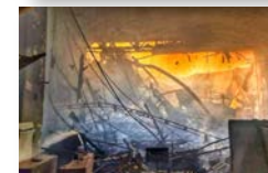
View from main stage, September 2020