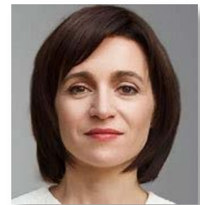
Pro-western Maia Sandu won Moldova’s 15 NOV 2020 election becoming the country’s first female President. With 58% of the vote, she supplanted the Moscow-backed incumbent in a landslide.

September 2020 brought disaster to Moldova’s historic National Philharmonic Hall...a huge blaze consuming the building, reducing everything to ashes, including all of the Symphony Orchestra’s instruments. Constructed in 1912, the cultural center served over the years as a revered platform for several MWCF sponsored youth given the opportunity to demonstrate their developing natural talent. Now it is gone, efforts to rebuild the structure are well beyond MWCF means alone. Where we can help is with a modest expansion of one of our previous initiatives...providing musical instruments. High quality instruments in excellent condition can be donated to MWCF, and overseas transport will be arranged. Contributed items not selected for orchestra use can either be audited for sorely needed cash or awarded as competition prizes for deserving grade school students aspiring to become musicians.