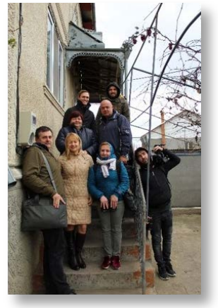
Camera crew at the MWCF sponsored Fortuna Home for Orphans in Drochia