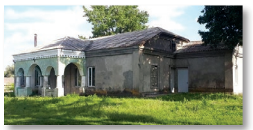
Old building front

Faith is blessed with a splendid capacity for good: an ability to comprehend the essence of a challenge and to help develop a