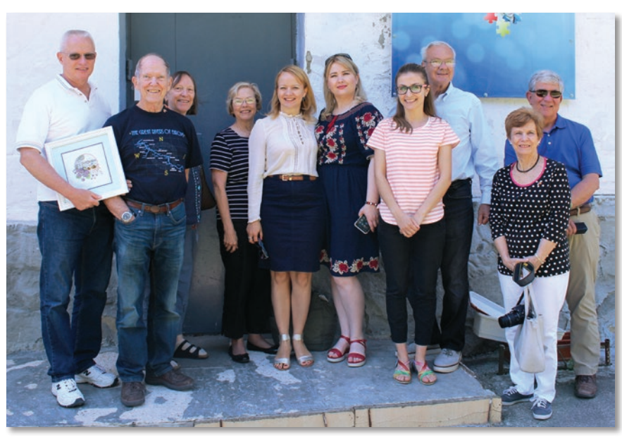
Teaming up for an Autism center

This journey touched our souls and for certain made Chan and I want to do more. Moldova is a land of warm people and many issues...a nation of contrasts for sure. At our July board meeting, Ray posted a twenty sampling of MWCF projects...an entire country map full of push pins. Much has been done and yet there is so much more to accomplish. Please help us make things happen for Moldova.