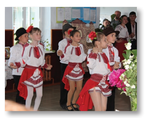
Keeping step with school renovation