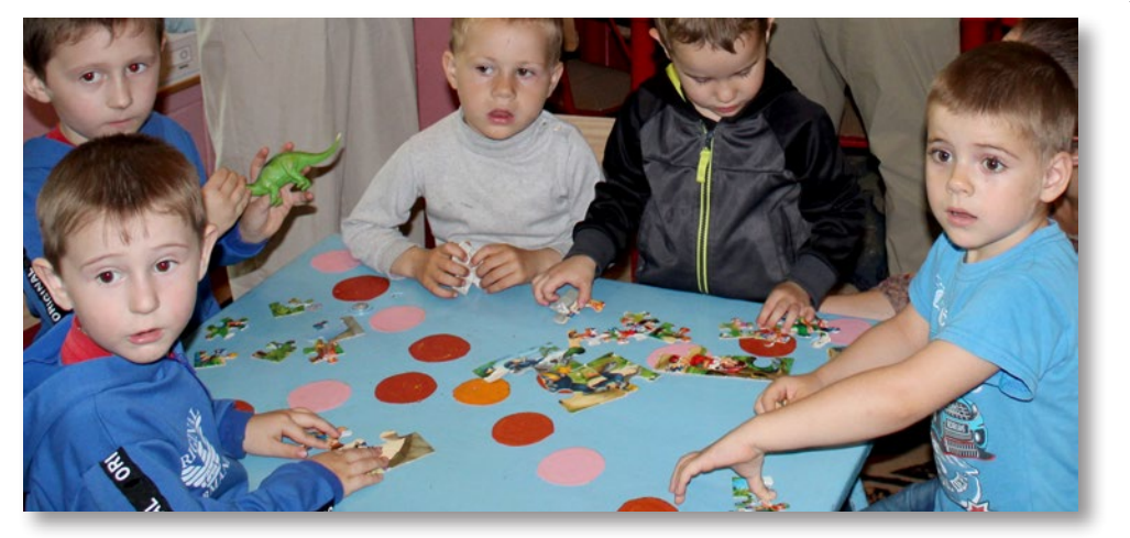
Long range planning committee #2 hard at work

reasonable solution; while possessing the wherewithal to bring a good plan to life. She has made a substantial gift to MWCF for the construction of a locally staffed, structured recreation and learning facility to serve multiple