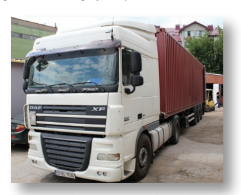
Sea Land Container: North Carolina to Norfolk, VA to Constanta, Romania to Chisinau, Moldova

EDUCATIONAL ASSISTANCE: An endless line of deserving students receive college and university support, while much of Moldova's public school system benefits from a steady flow of books and school materials. MWCF teams up with the North Carolina offices of Secretary of State and Public Instruction, NC medical centers, the Moldovan non-profit PHOENIX, and occasionally the Air National Guard in shipping and distributing classroom essentials throughout Moldova.