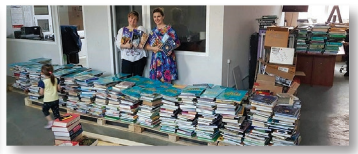
A portion of the tons of educational and medical supplies & equipment, small farmer support, and other humanitarian assistance shipped yearly