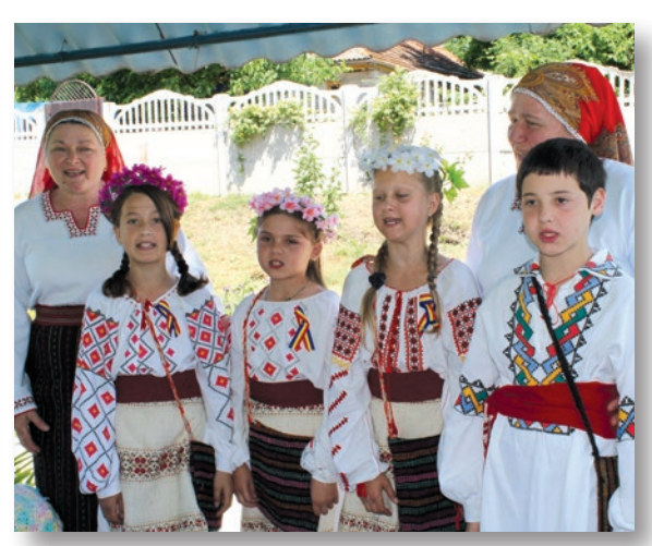
A most joyful reception