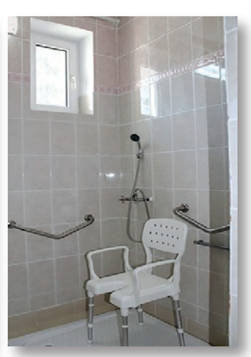
A comfortable shower